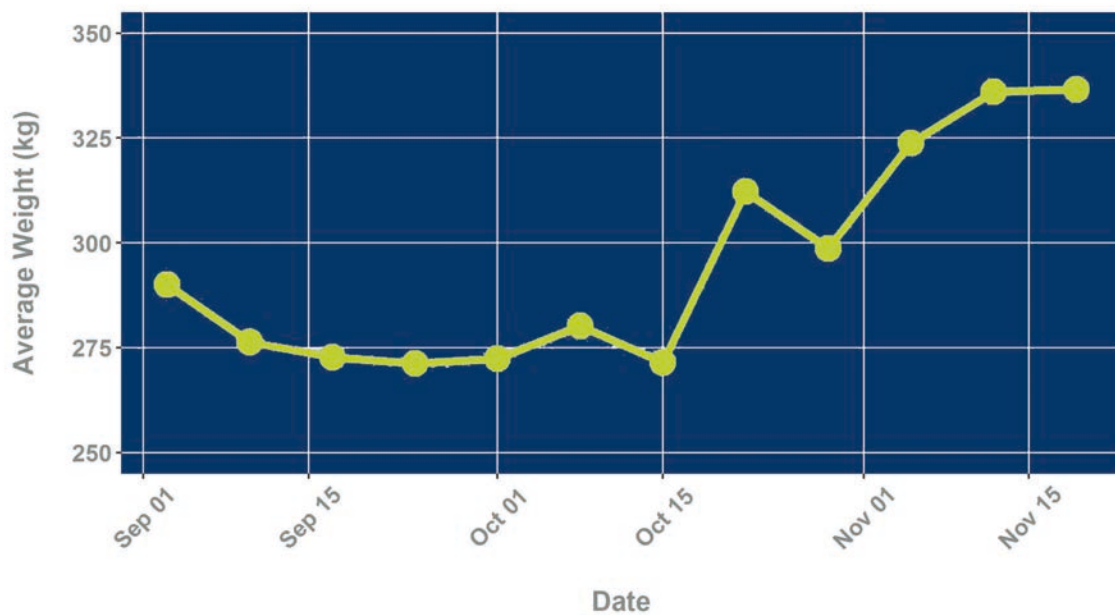
Figure 2) Weekly average weights for the 146 steers using the WoW system at Berrigurra. There was a total of 115mm of rain in the month of October, which resulted in reduce animal weighings and variable data, however, the growth path returned to normal in November.

Using weekly averages it is possible to track the growth paths of whole mobs or sub-groups of cattle (Figure 2). The data can be downloaded locally and processed with standard software such as Microsoft Excel or transmitted across a network and made available automatically through software such as Data Muster the CQUniversity's herd management software.