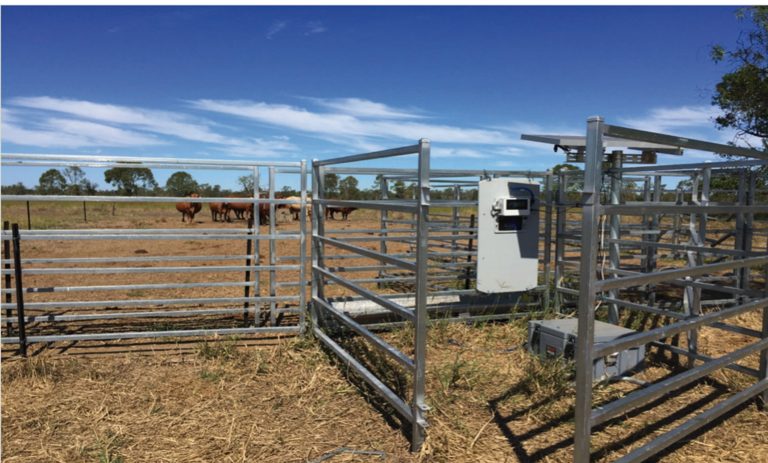
Figure 3) Image showing the enclosure containing the electronic components that make up the WoW system including RFID Panel Reader, Solar Panel and storage case with 2 x 12volt batteries.