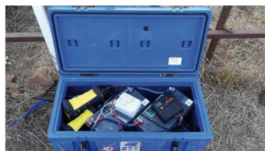
Figure 4). The storage compartment showing the 2 x 12volt batteries, solar regulator, 12volt to 5volt power regulator and the WoW indicator and RFID reader.