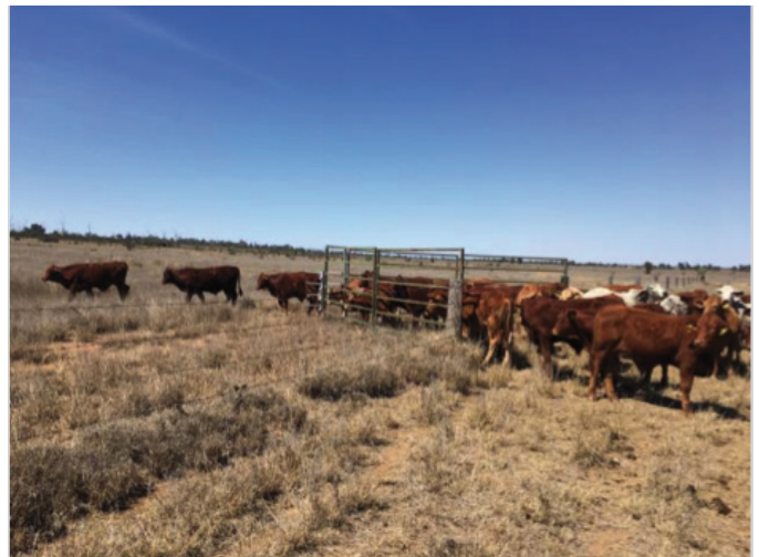
Figure 1a) The ‘force’ and race leading into the WoW compound and 1b) the exit spear with steers exiting the compound