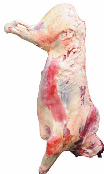
A tenderstretch carcass.

Although tenderstretch was proven to be effective in improving tenderness twenty years ago, it was not widely adopted due to the perceived inconvenience, extra costs and the lack of financial incentive for improved eating quality. MSA grading quantifies the benefit of tenderstretch, offering the potential to increase returns. This has resulted in several MSA abattoirs adopting the process.